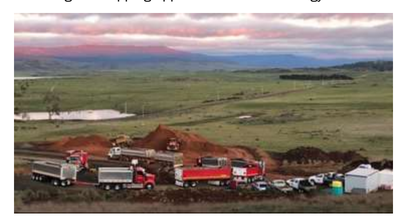
Figure 1 Truck loading at sunrise, Bald Hill.

This project was accelerated so as to use the transport and port infrastructure during a period of under-utilisation, to benefit from low fuel prices and to allow the cement-grade customer to take advantage of shipping opportunities. The strategy has worked well for all concerned.