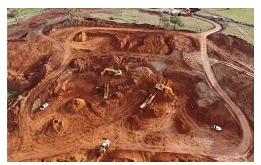
Figure 4 Final stages of mining and screening are kept tight to minimise the footprint of mine operations for efficient rehabilitation – see Figure 5 below.

Mining, processing and blending at the mine site was done by Hazell Bros contractors and transporting to Bell Bay port was by Dave Wagner & Son Pty Ltd.