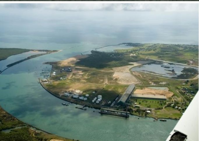
Figures 2 & 3: Bundaberg Port

This Queensland port is similar in size and scope to the port of Porbandar in Gujurat, India from which Rawmin exports its bauxite in large capacity vessels carrying greater than 65,000 tonnes