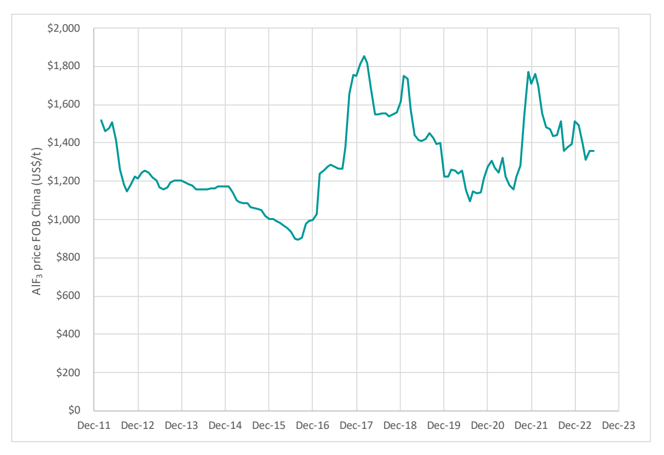
Figure 7: Aluminium fluoride monthly prices FOB China