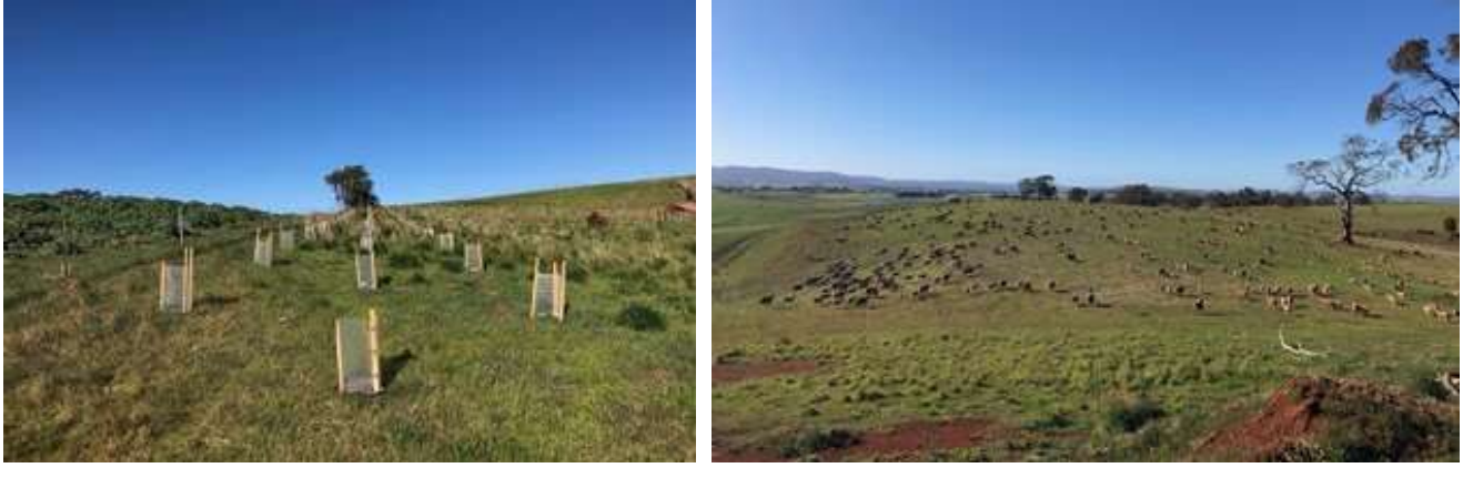
Figure 4: Tree windbreak at Bald Hill bauxite mine, Tasmania, planted in Spring on rehabilitated land