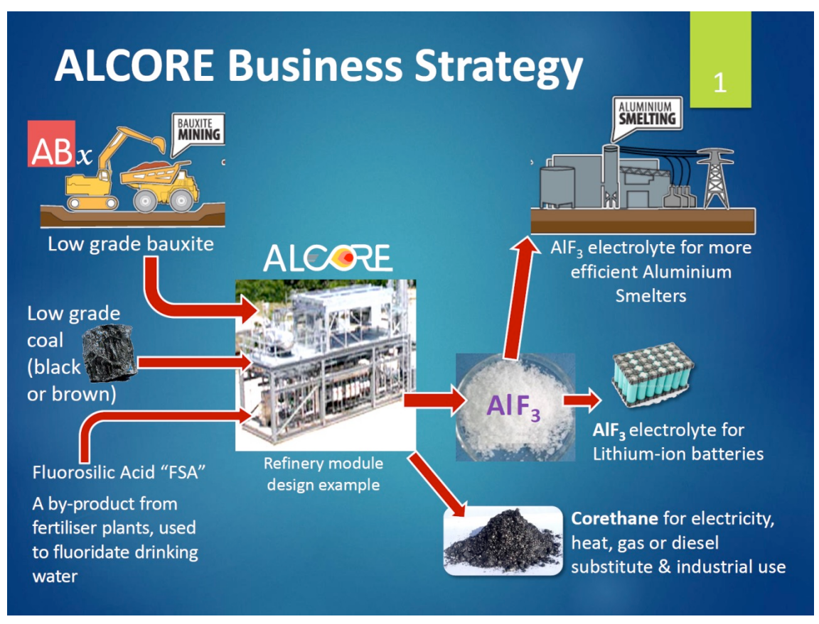
Figure 1: Summary of the ALCORE Business Strategy