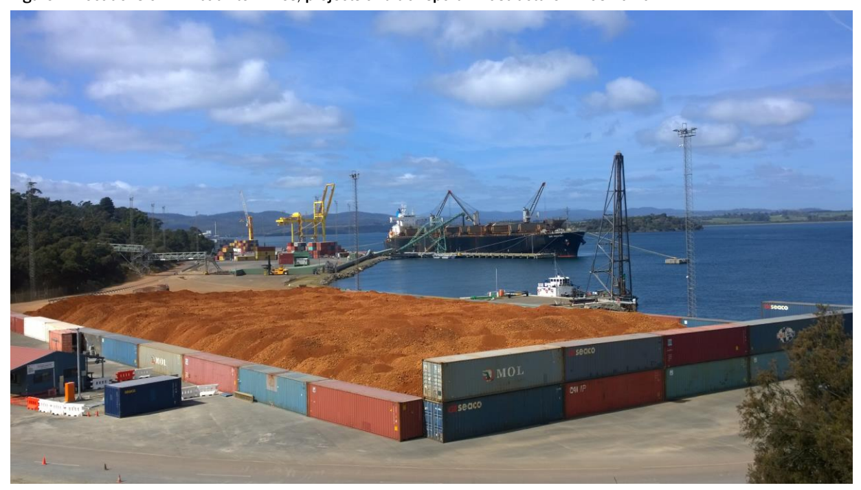
Figure 2: The 30,000 tonne cargo assembled at Bell Bay export ports. Note that the containers are used as dust barriers to prevent cross contamination with other cargoes. The bauxite is shipped in bulk carrier ships similar to the ship shown here.