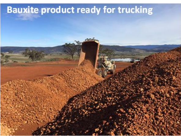
Figure 3: ABx supply chain operations from pit to mine stockpiles, blending, transport and stockpiling at Bell Bay Port.