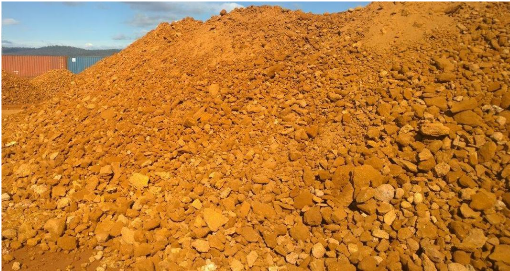
Figure 6 (left)

ABx blends bauxite at the mine site and at all stages of delivery to maximise mixing, thus providing a consistent product.