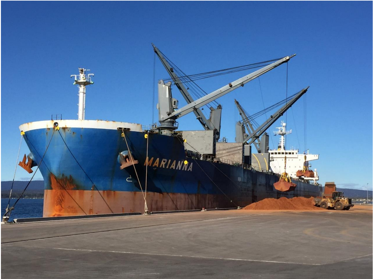
Figure 3: The M/V Marianna being loaded with 35,000 tonnes of bauxite at Bell Bay export port