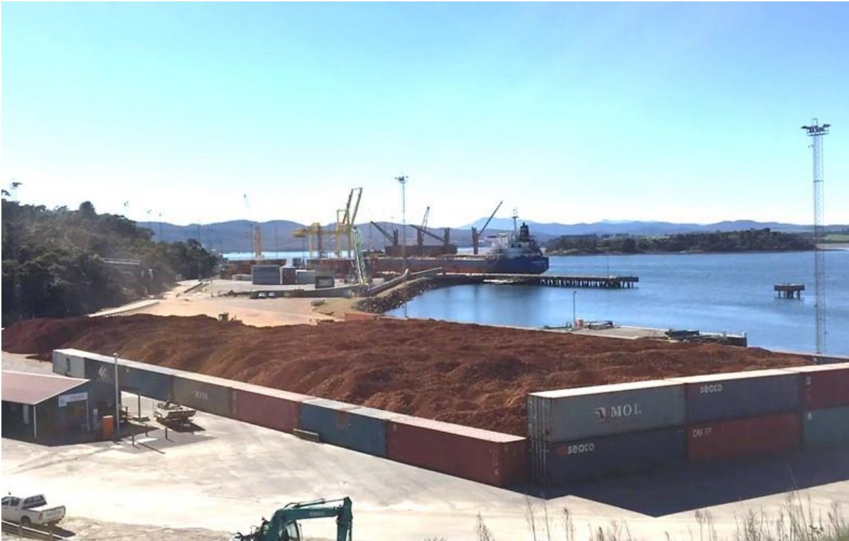
Figure 2: The M/V Marianna (in distance) being loaded with 35,000 tonnes of bauxite from the two large port stockpiles (in foreground) at Bell Bay export port, Tasmania