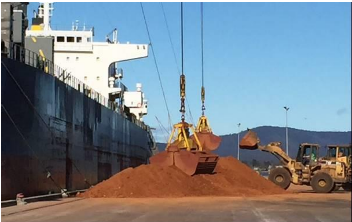
Figure 4: Ships cranes and clamshell grabs at work whilst front end loaders heap up the bauxite for faster loading