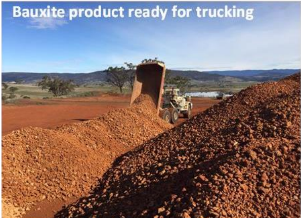
Figure 5: ABx supply chain operations from pit to mine stockpiles, blending, transport and stockpiling at Bell Bay Port.